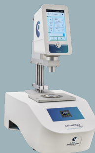
RM 200 CP4000 PLUS