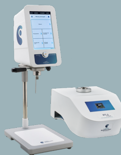
RM 100 PLUS + Oven RT-1 PLUS