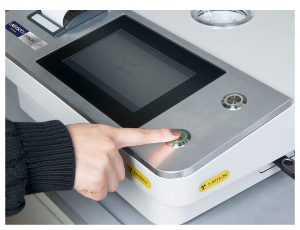
Starting the analysis