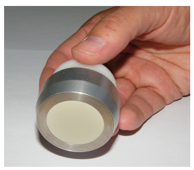
Pressed pellet in pellet holder