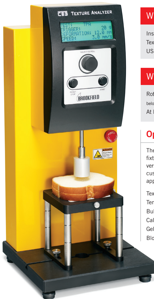
CT3 with Fixture Base Table and Cylindrical Probe in compression (TPA) mode

allows for larger samples and more accessory choices